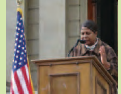
Consumers were requested by the United States Psychiatric Rehabilitation Association of Michigan to speak on the steps of the Capitol for Power Day.