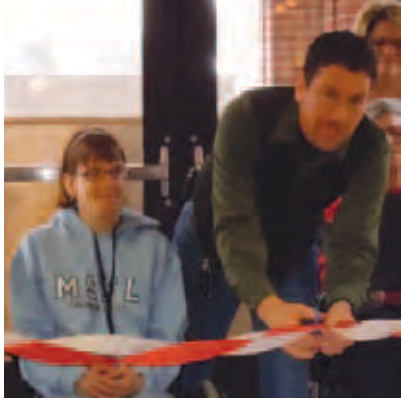
Properties-Facilities manager cuts the ribbon for the renovated Welcome Center at the Jolly Road location.

Parents report one or more of the following outcomes for themselves: increased ability and developmental needs, needed community to access and or increased ability to effectively cope with stress.