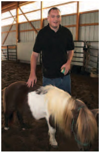
Seven individuals participated in equine assisted learning at Sierra Rose Farms.

Certified Peer Mentors use their own personal experiences to provide essential services that promote self determination, help peers direct their own lives, and support others to become self sufficient. Five consumers recently completed the Peer Mentor Training sponsored by the Developmentally Disabled Council and the Department of Community Health. The next step for the trainees will be to complete an internship with Community Services for the Developmentally Disabled (CSDD) case managers to gain experience working directly with individuals with developmental disabilities.