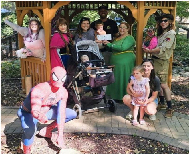
One lucky family won donated passes to the Impression 5 Science Museum

Thank you to our event sponsors Peckham Inc, and National Alliance on Mental Illness (NAMI) of Lansing.