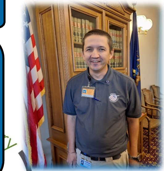
CAC Member Since 2024

I present my recovery story every chance I get at Mid-Michigan Police Academy, Crossroads Church, Community Mental Health Association of Michigan (CMHA) Conferences, and through authoring 19 books.