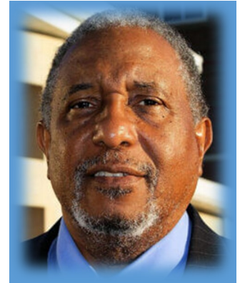
Keynote Speaker: Bernard Lafayette Jr.

The 40th Annual Greater Lansing Area, Dr. Martin Luther King Day of Celebration luncheon will be held on Monday, January 20, 2025 at the Lansing Center, Lansing, MI. The signature event is the annual Day of Celebration; which has become the place to be on Dr. King's holiday because of the caliber of speakers. It is a celebration of Dr. King's legacy and the power of community.