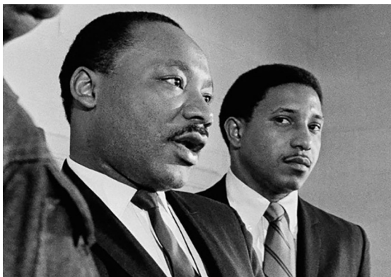
Bernard Lafayette Jr, right with Rev. Martin Luther King Jr. in 1968